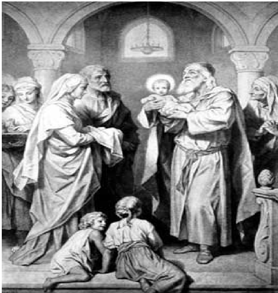
Presenting Jesus at the Temple Luke 2: 21--38

VISION STATEMENT: St. Stephen's seeks to be: a Christ centred, Holy Spirit led, outwardly focused, caring community